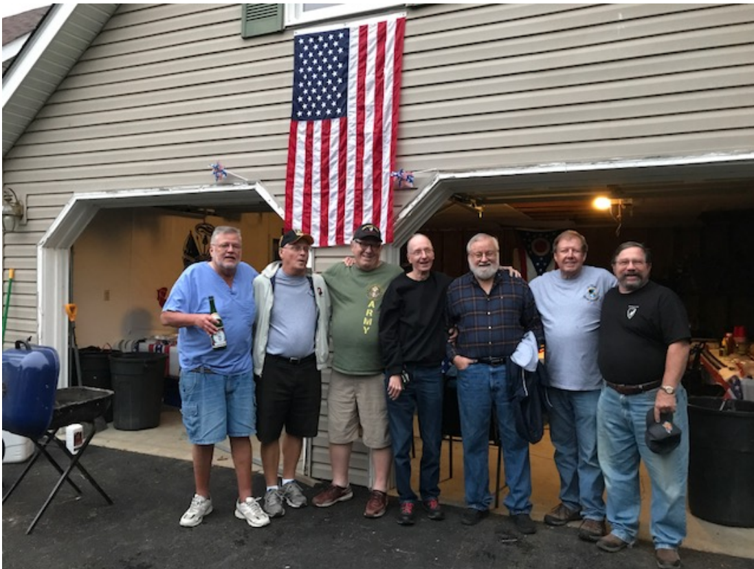
ALL Elinter 9 8 J's