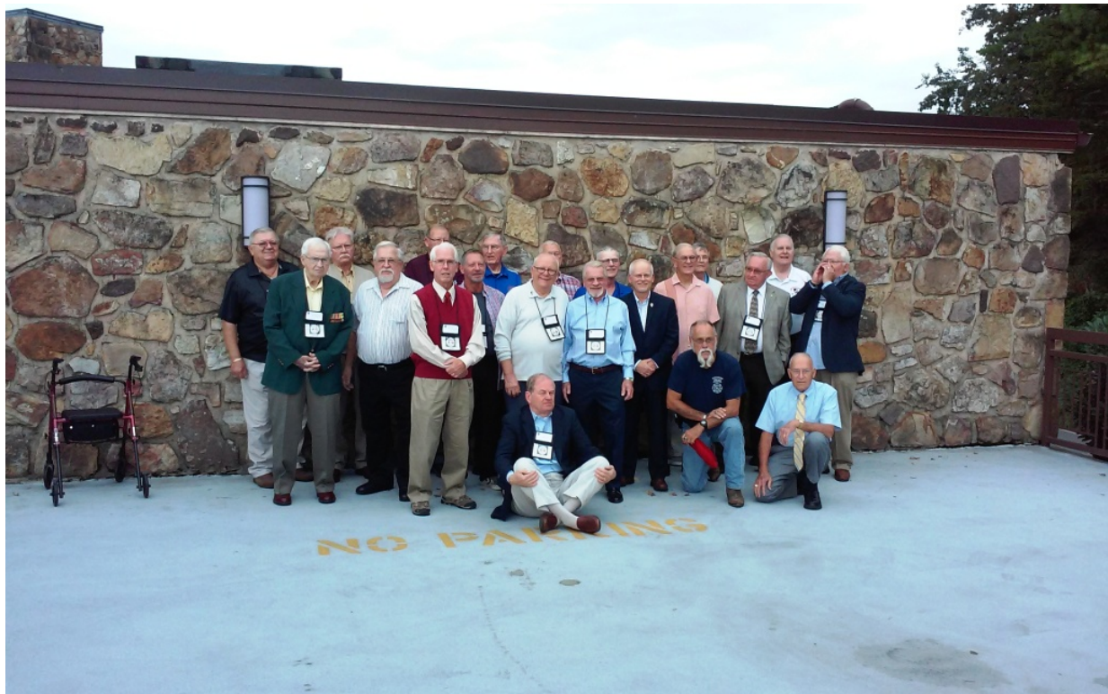
DET 4 VETERANS AT 2017 REUNION IN GATLINBURG, TN