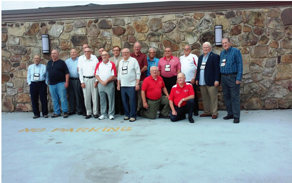
DET 27 VETERANS AT 2017 REUNION AT GATLINBURG, TN