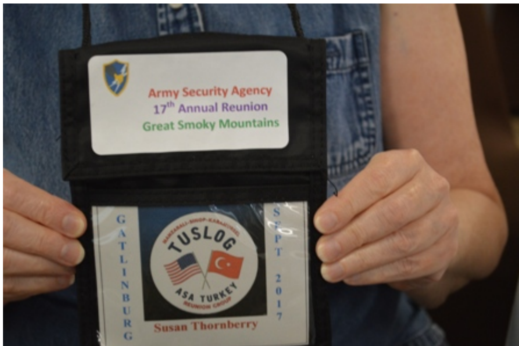
The 2017 ASA Turkey Badge