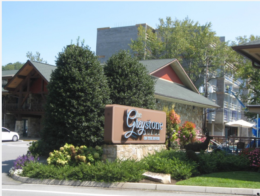
The host hotel