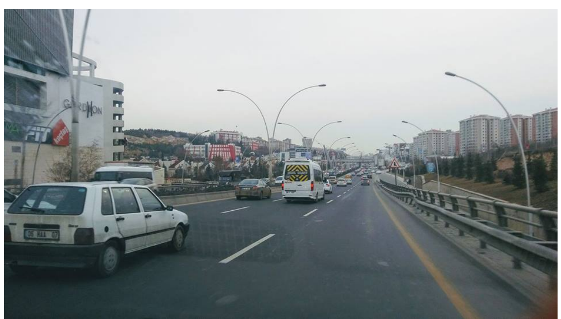
Almost rush hour in Ankara- 6 lanes both ways & just before 8 lanes coming & going! Suddenly realized that this cannot be year 1966!!