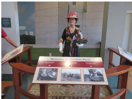
The Edith Deeds mannequin