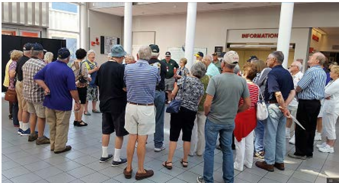
USAF AVIATION MUSEUM BRIEFING ABOUT THE TOUR TO 47 ASA'ers