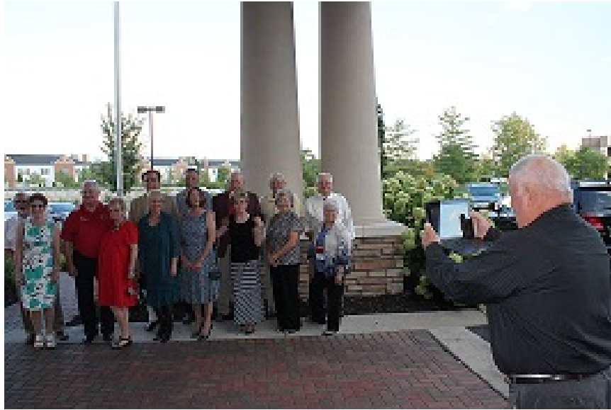
The Det 27 vet's and their wives