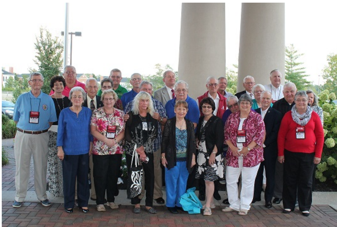
Det 4 Vet's and their wives