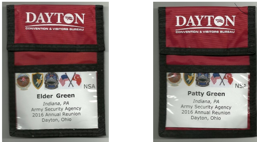
The 2016 reunion badges courtesy of the Dayton CVB