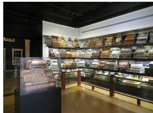
The National Cash Register display