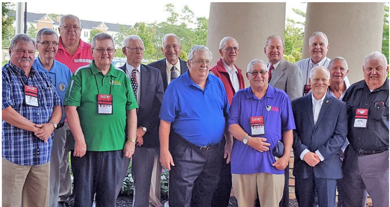
Det 4 Vet's: