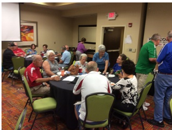
Hospitality room photo's