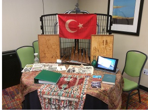
Kevin Reichley Turkey display