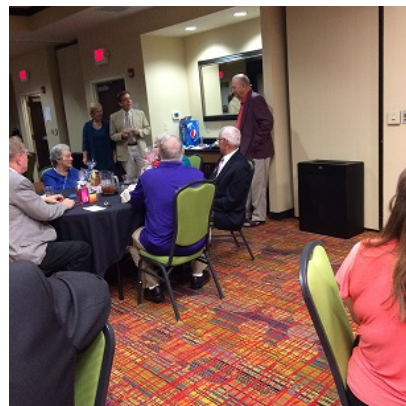
After the banquet