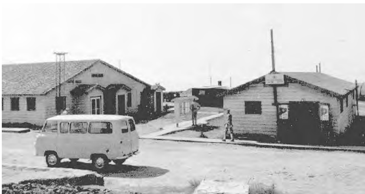
THE DET 4 PX IN 1959