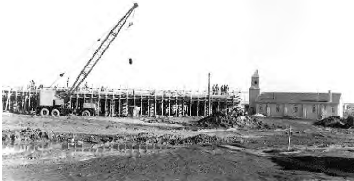
NEW CONSTRUCTION AT DET 4 IN 1959