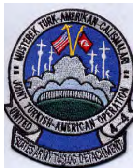
Det 4-4 Karamursel Air Station