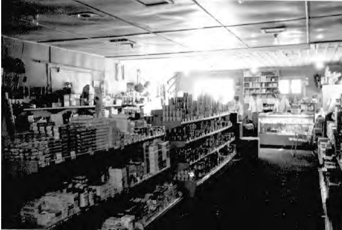
INSIDE THE DET 4 PX IN 1959