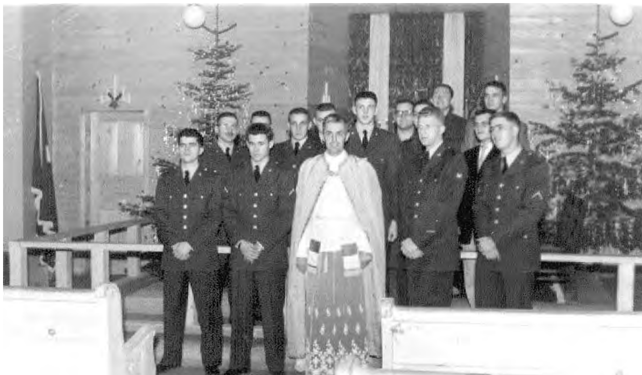
THE DET 4 CHAPEL IN 1959