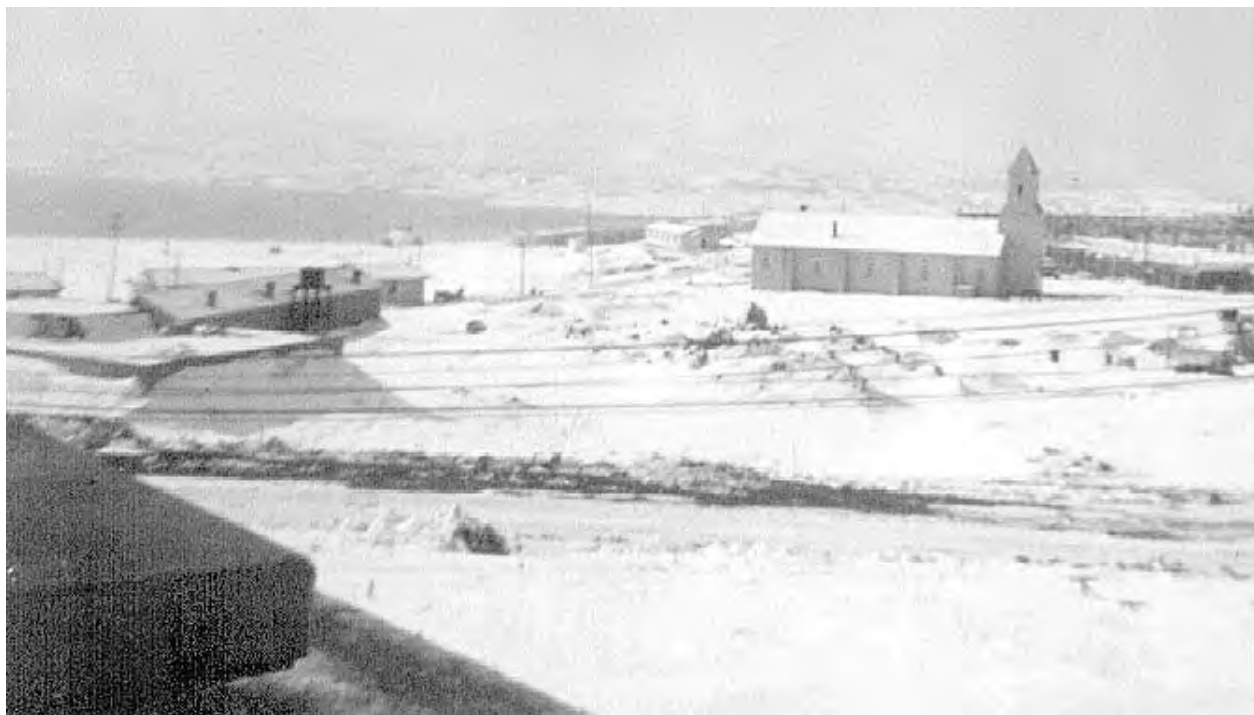
THE DET 4 CHAPEL IN 1959