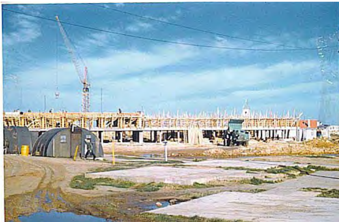
NEW CONSTRUCTION AT DET 4 IN 1959