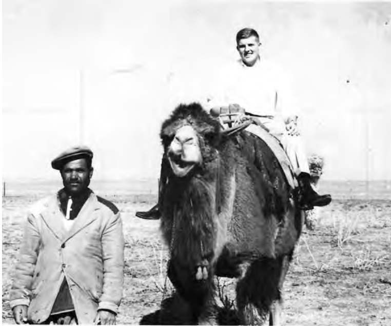
Turkey – What a ride!