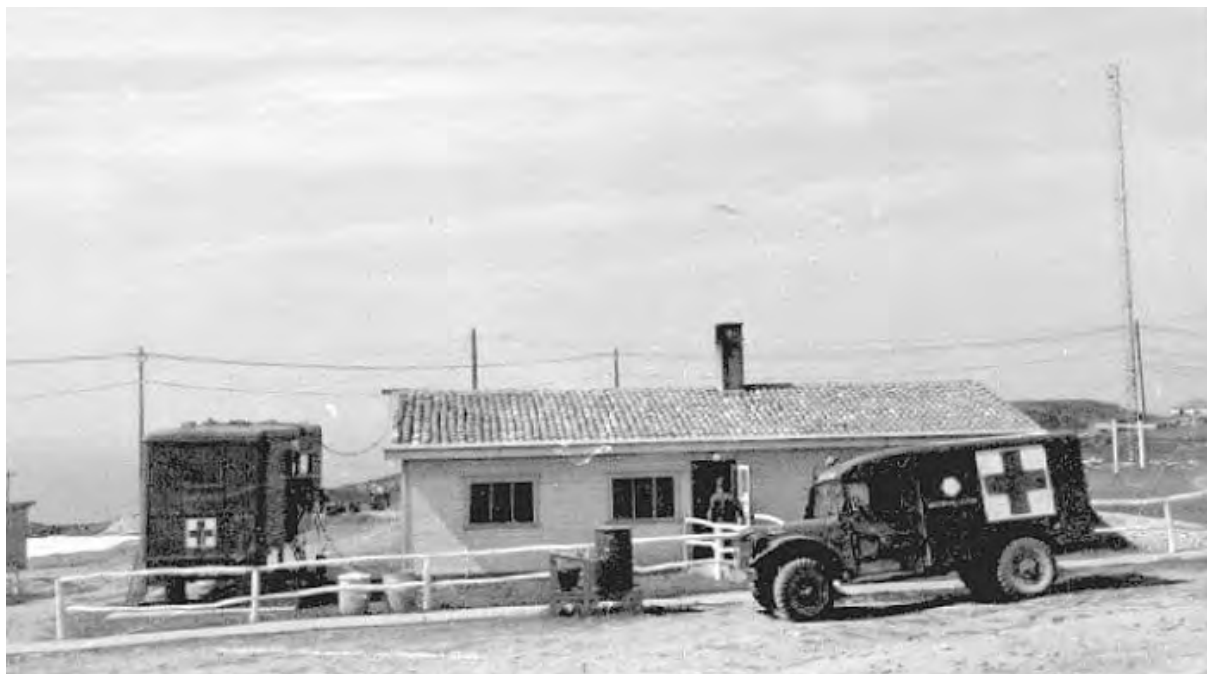
THE DET 4 DISPENSARY 1959