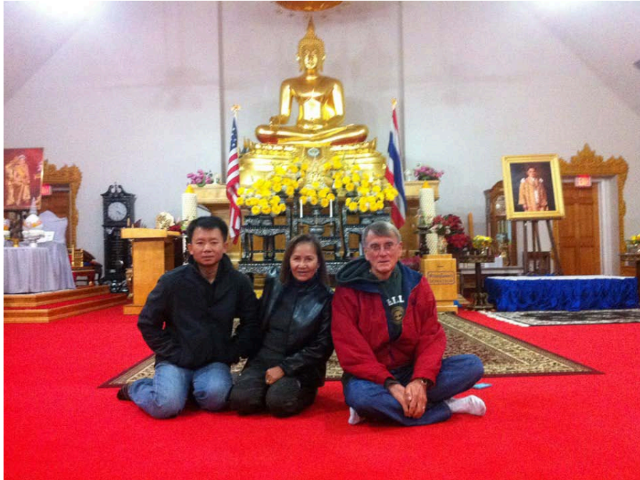
Houston, TX 15 December 2013