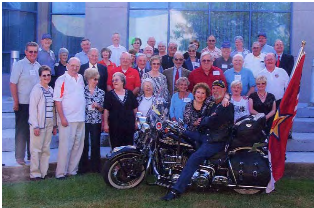
THE 2010 REUNION AT TOLEDO