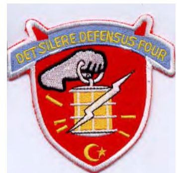
Det 4 Diogenes Station Sinop