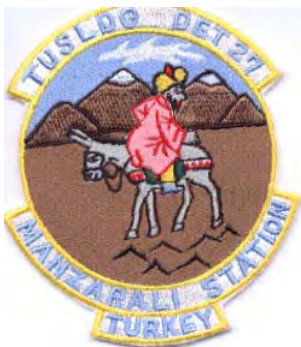
Det 27 Manzarali Station Ankara