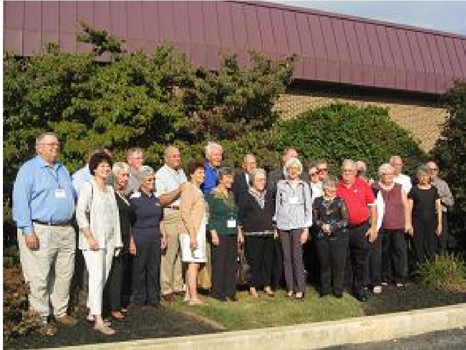
Det 4 vet's with their wives