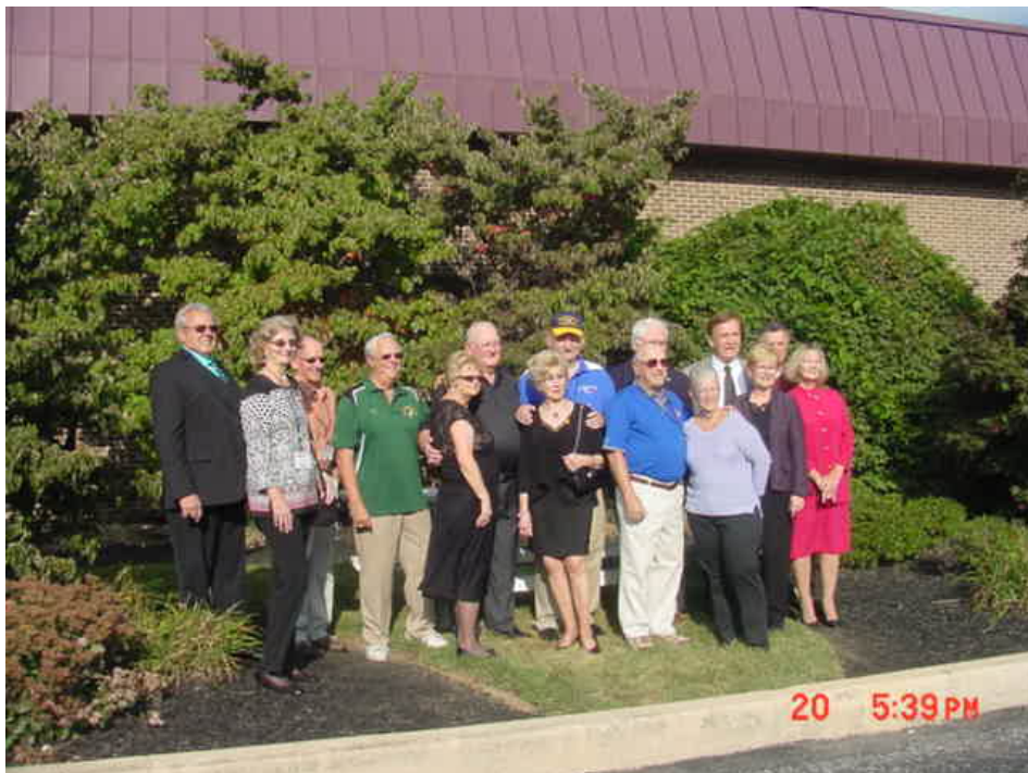
Det 27 vet's with their wives