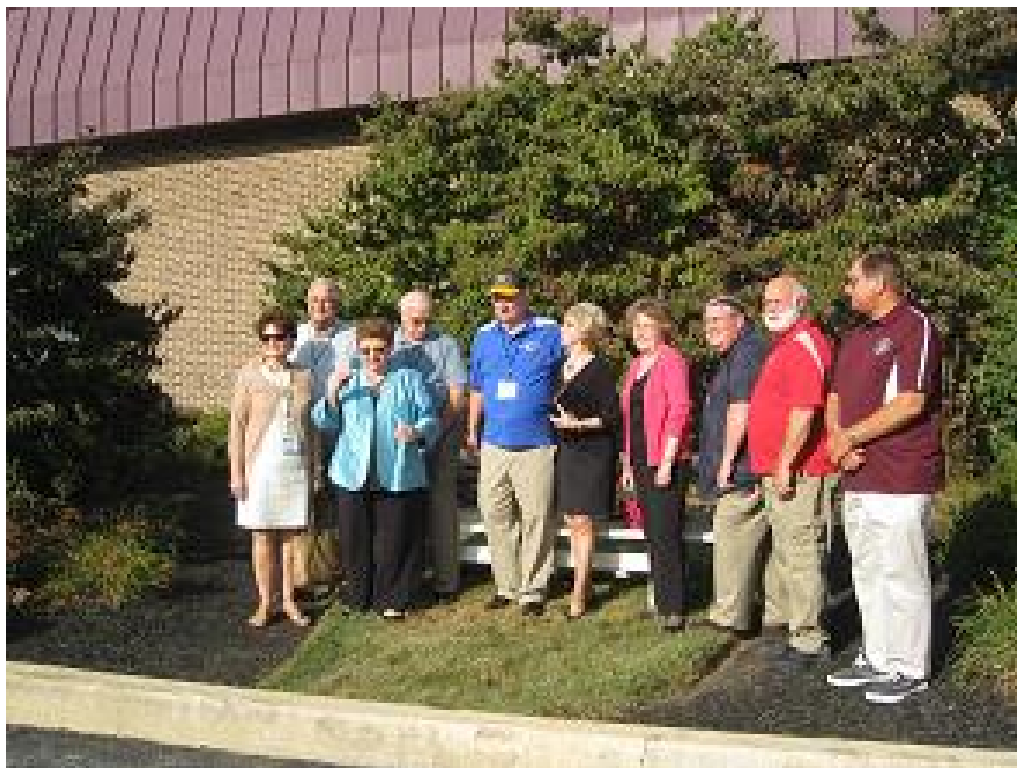
Det 4-4 vet's with their wives