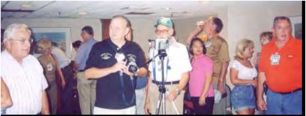
2002 REUNION AT HERSHEY, PA