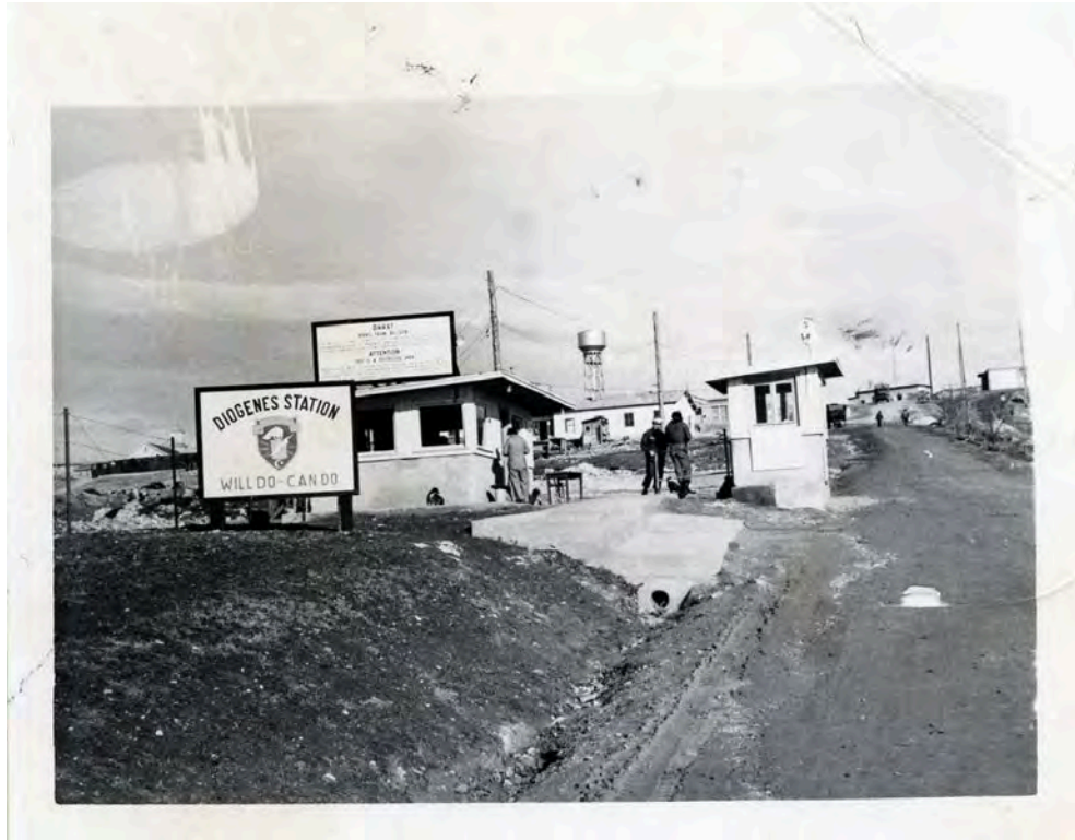
THE DET 4 FRONT GATE AS IT WAS IN 1962