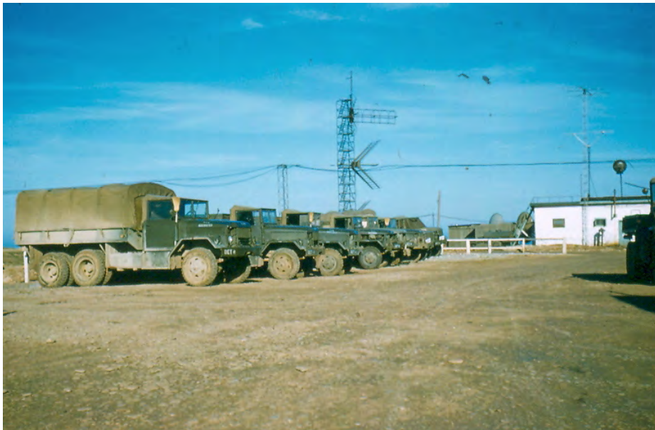
The Det 4 Motor Pool area in 1958