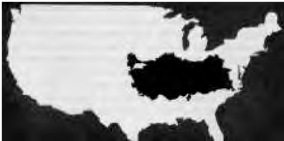
The size of Turkey

Per note on the back - the photo was taken on the Ayancik Road in front of a Turkish Highway snowplow.