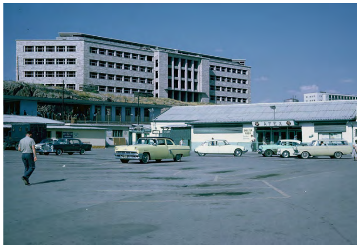
The AFEX in Ankara

During my time at Manzarali, I visited Athens for 5 days. I made plans to take the Air-Evac to Athens and return via THY Turkish Airline. When I reported at the airbase for my flight, I was told by the USAF clerk that my leave orders did not allow me to travel in civilian clothes. Fortunately there was an Army office nearby and I knew the fellow who worked there. I asked him to "amend" my orders to say I was authorized to travel in civilian clothes, which he did by typing that in. I walked back to the USAF office, handed in my orders, and was put on the manifest with no questions asked.