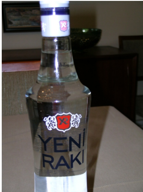
Also had a nice bottle of Raki(Turkish)