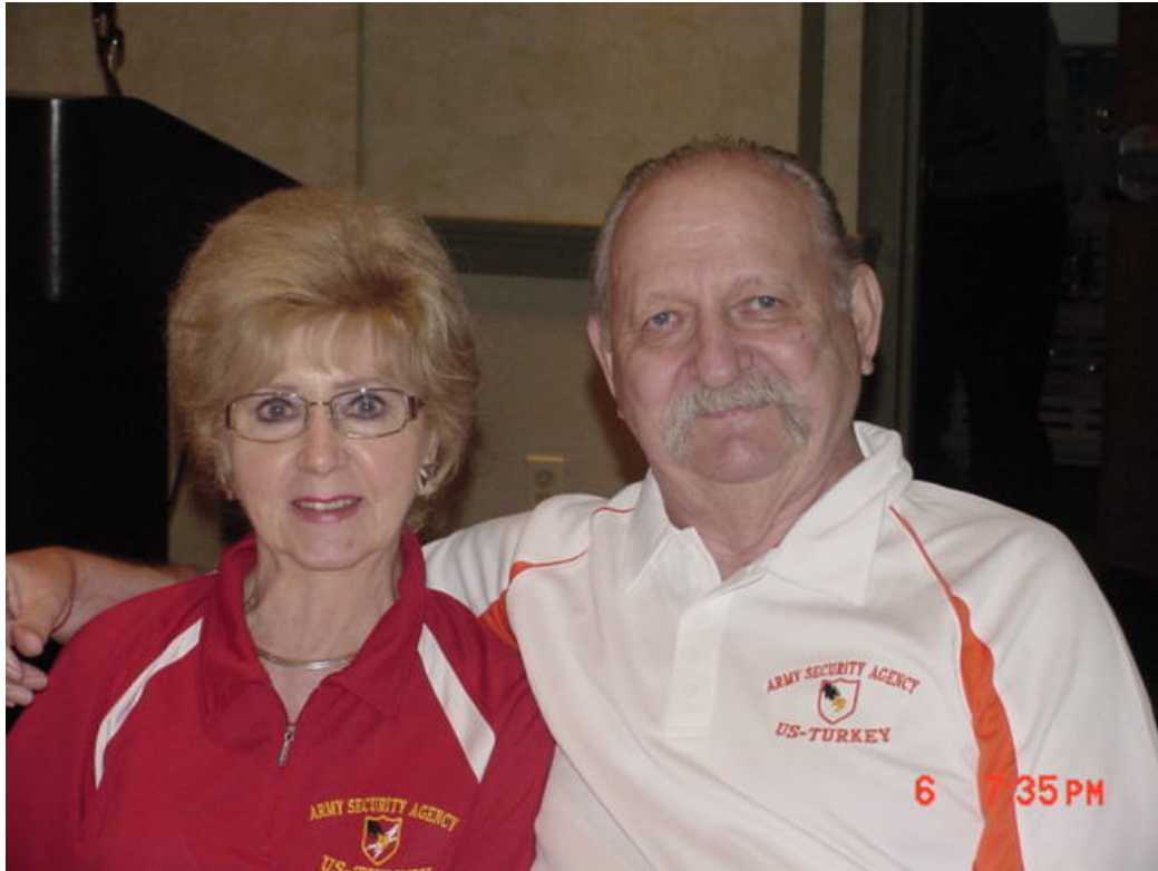
THE BACKBONES OF THE 2010 TOLEDO REUNION