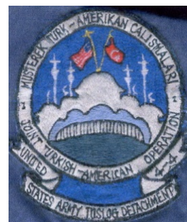
Det 4-4, Karamursel