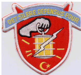
Det 4, Sinop