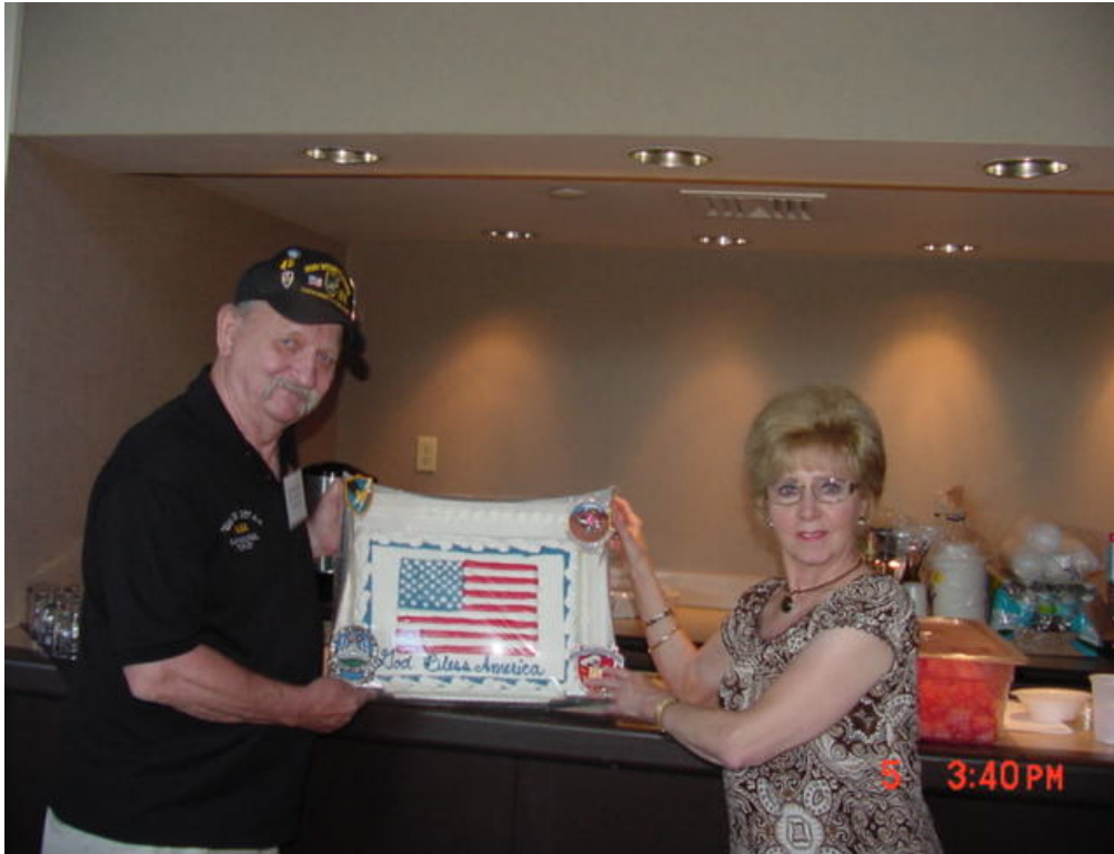
THE 2010 REUNION CAKE