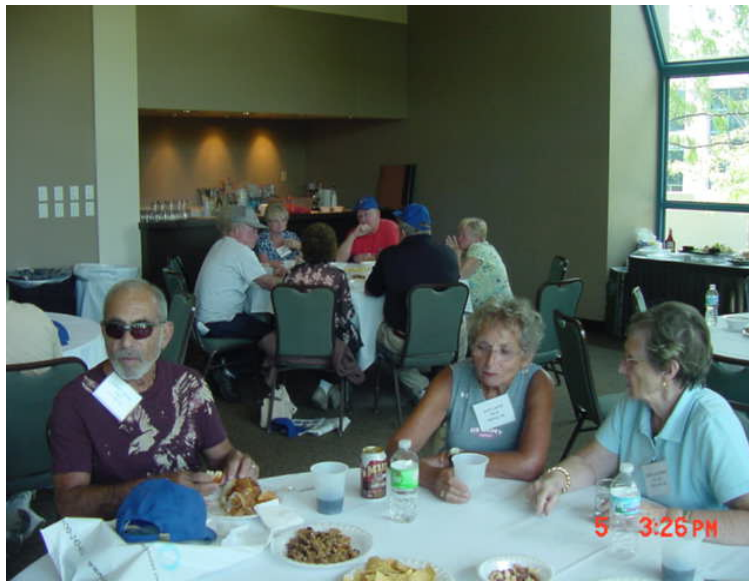
THE HOSPITALITY ROOM