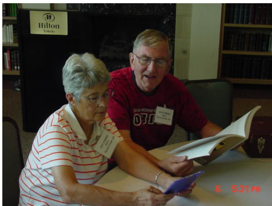
They have been back to Sinop