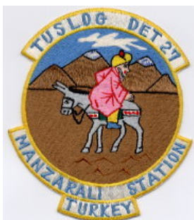
Det 27, Manzarali Station