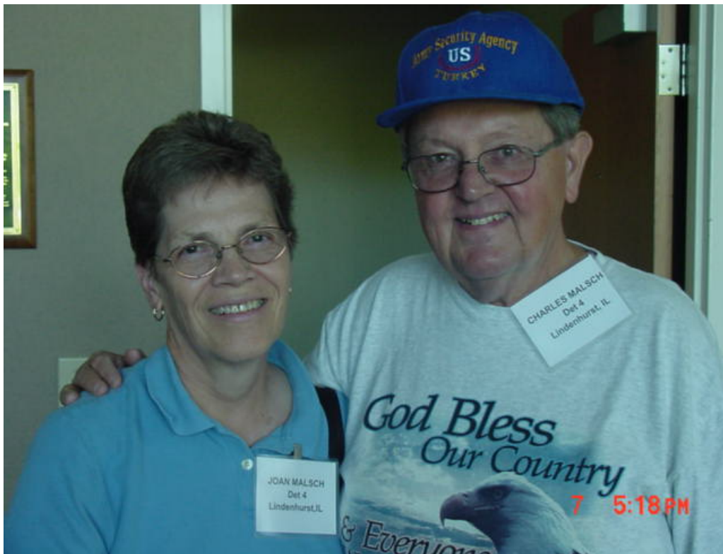
Great smiles and great people