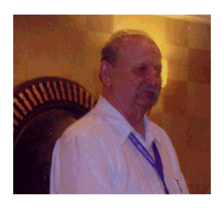
Al Green at the banquet