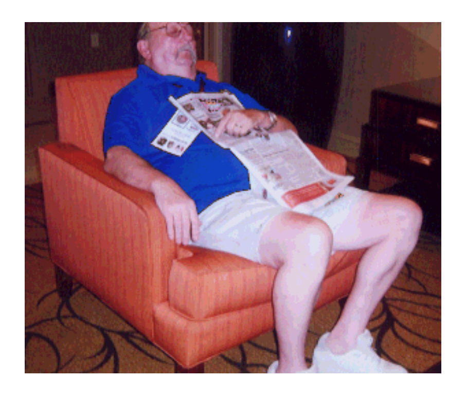
Al Green caught taking a nap