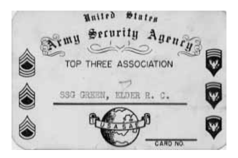
Please note that E8 and E9 grades were introduced in 1958

I receive the above card in 1960 at Bad Aibling. Note that the highest enlisted grade on the card was Master Sergeant E-7 and SP1 which was later changed to SP7.