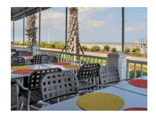
Station 10 Bar & Grill Oceanfront Patio

Station 10 Bar & Grill at Ocean Beach Club