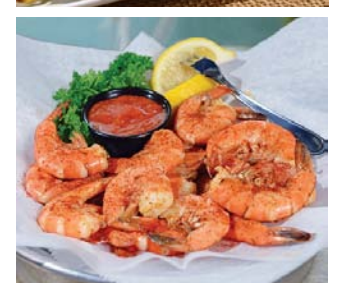
Rockafeller's on Rudee Inlet