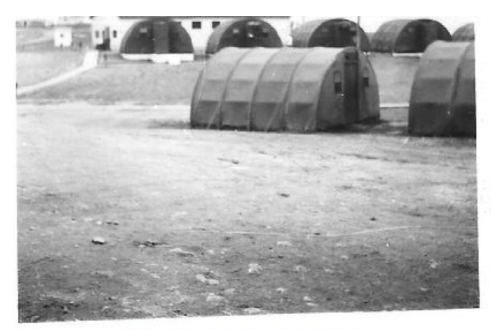
The Jamesway huts at Det 4 in 1958

the place like a kid on the way to the Black Sea whereas our pilot scanned the sky constantly and looked bored.