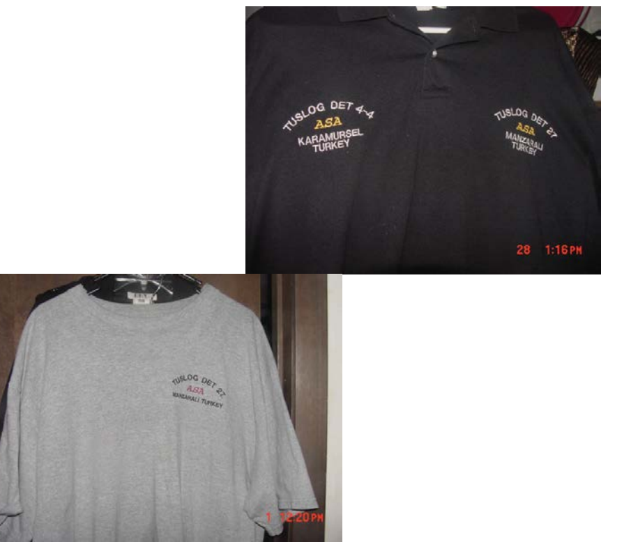
A limited number of the above polo and T-shirt photo's and hats with Det 4, Det 27, Det 4-4 and Det 120 will be sold at the reunion