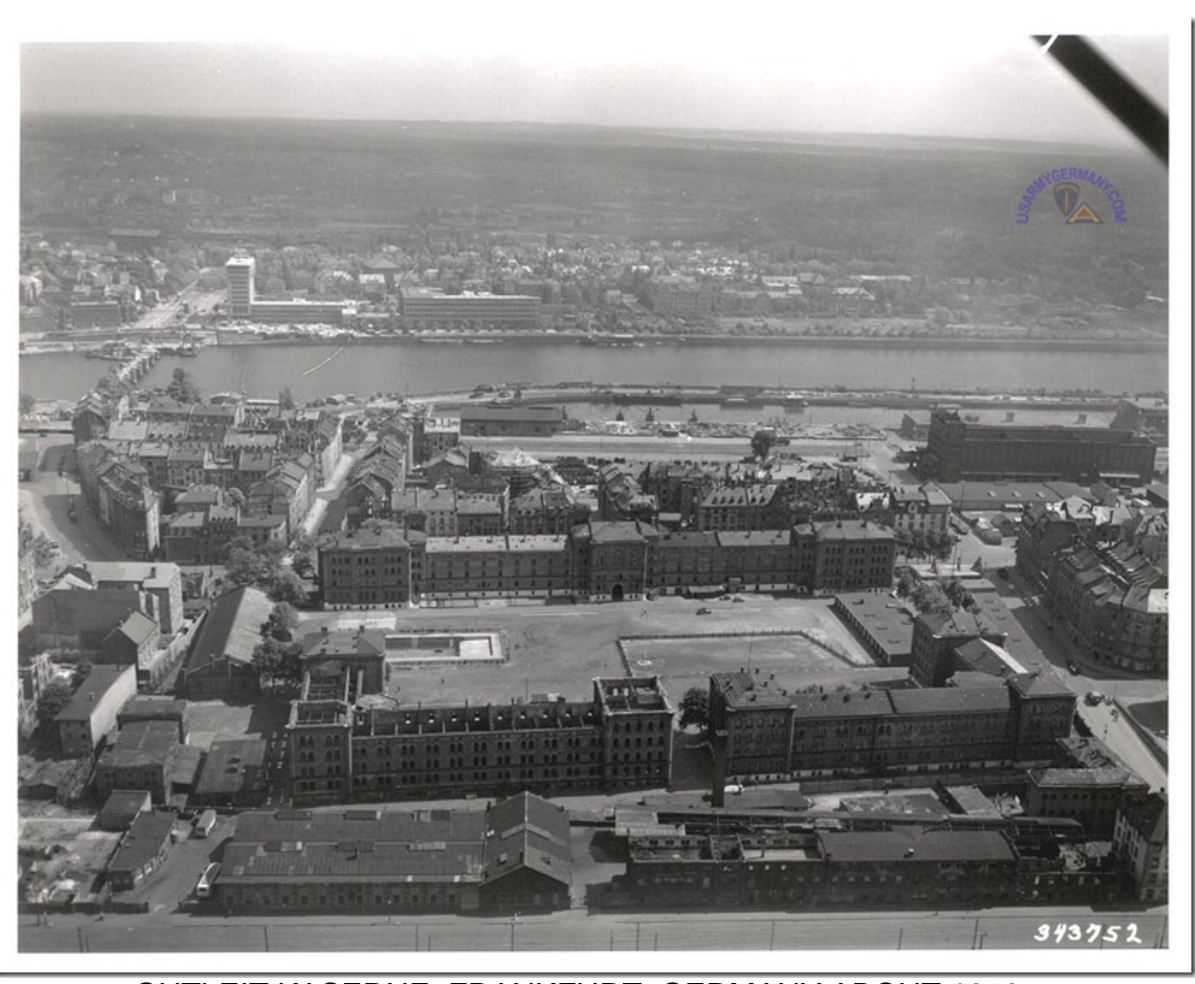
GUTLEIT KASERNE, FRANKFURT, GERMANY ABOUT 1959