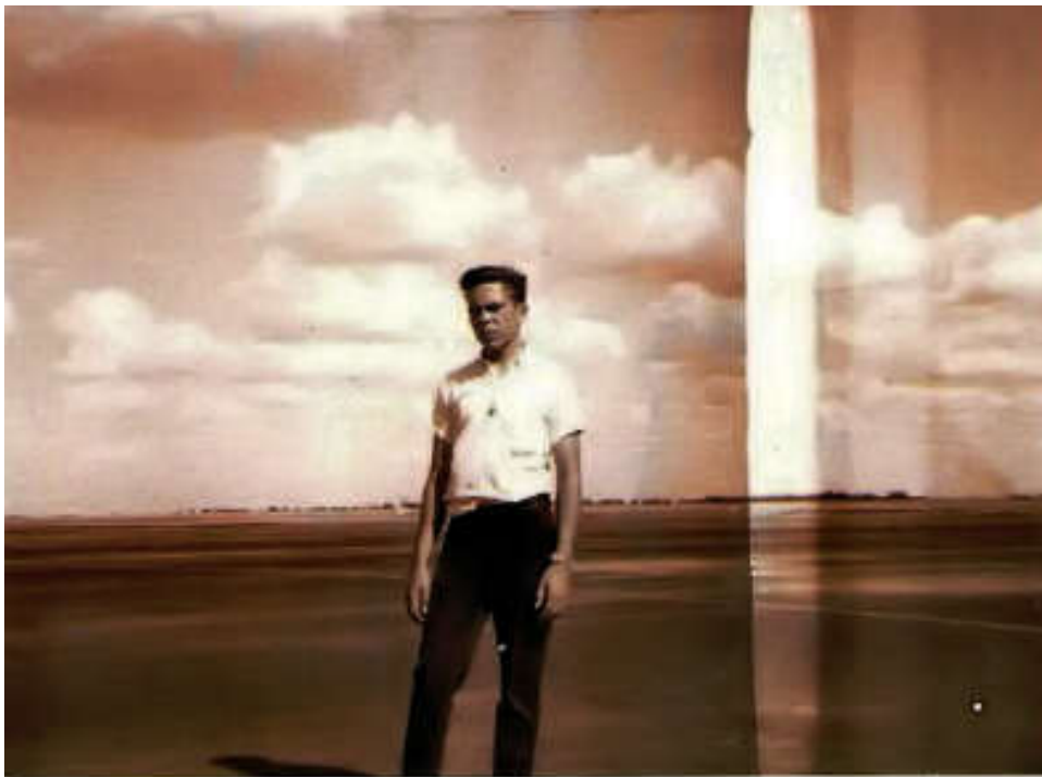
GOODFELLOW AFB LANDING STRIP, GAFB SAN ANGELO, TX, 1966