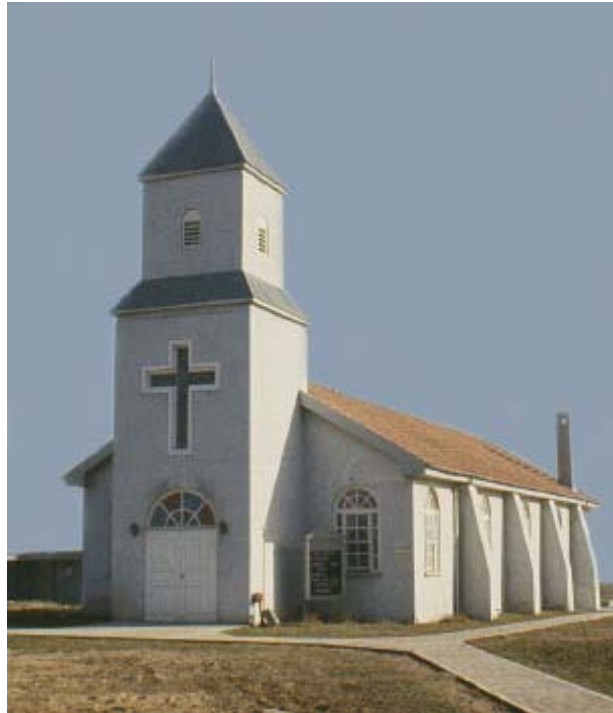
The "Jim Boyte" chapel at Det 4.