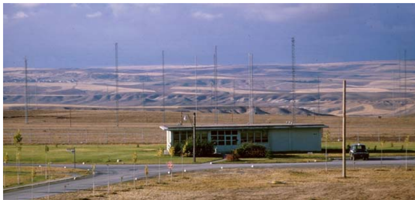
The PMO and part of the huge antenna field at Det 27